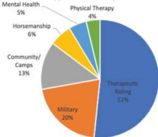
Types of Weekly Services

* Detailed financial information is available at nvtrp.org/financials or upon request from the VA Department of Agriculture and Consumer Services.